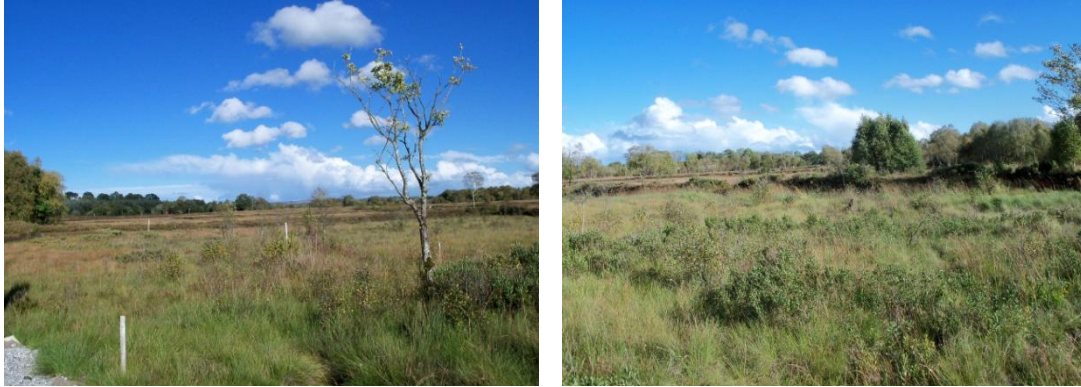
Views Of Countryside From site